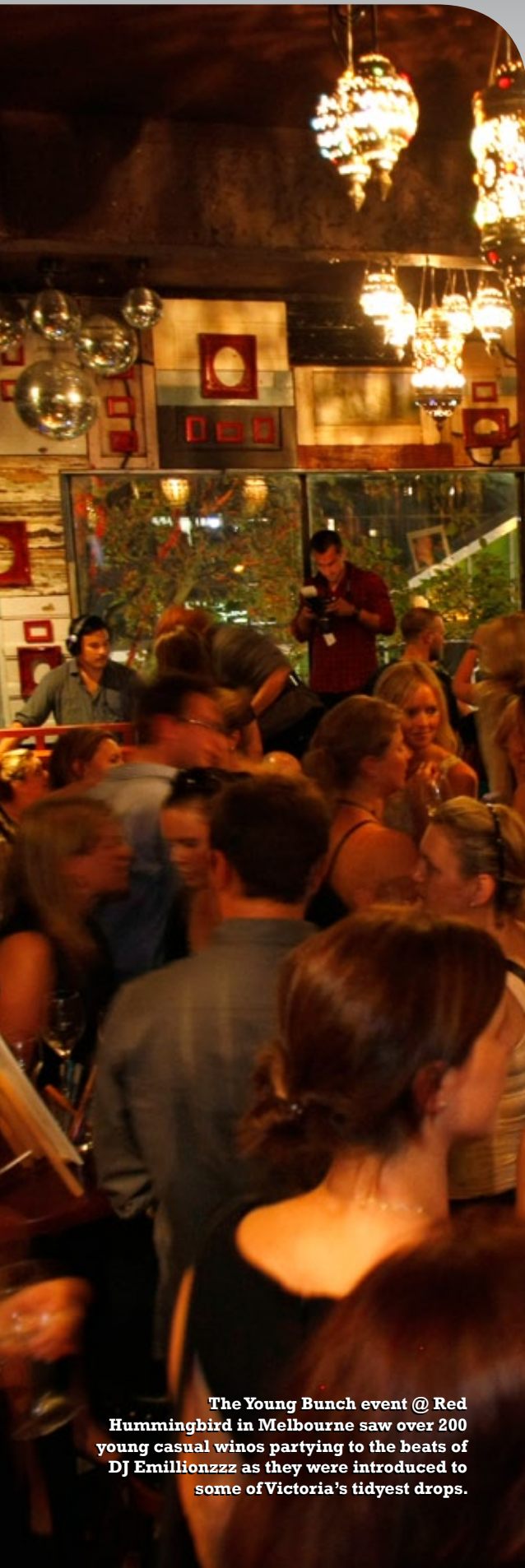
The Young Bunch event @ Red Hummingbird in Melbourne saw over 200 young casual winos partying to the beats of DJ Emillionzzz as they were introduced to some of Victoria's tidiest drops.